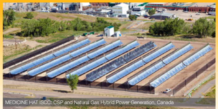
MEDICINE HAT ISCC: CSP and Natural Gas Hybrid Power Generation, Canada