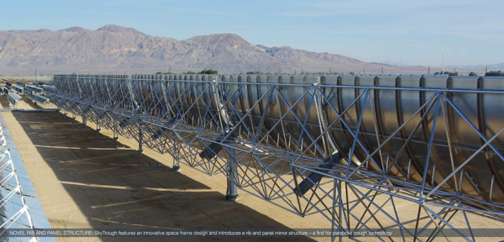
NOVEL RIB AND PANEL STRUCTURE: SkyTrough features an innovative space frame design and introduces a rib and panel mirror structure – a first for parabolic trough technology