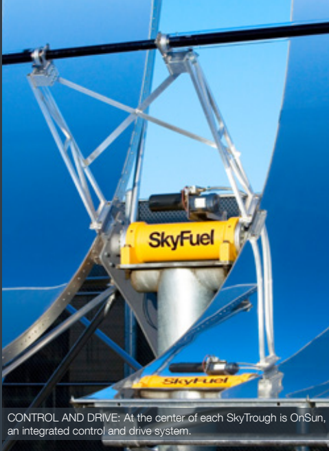
CONTROL AND DRIVE: At the center of each SkyTrough is OnSun, an integrated control and drive system.

SkyTrough concentrates sunlight onto an evacuated thermal receiver, held with precision along the full length of the collector's focal line. A heat transfer fluid flows through the receiver to absorb the sun's energy and then delivers the thermal energy to a heat exchanger, where it generates steam for power generation or industrial processes.